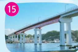
Jogashima Ohashi Bridge

Kitahara Hakushu, a renowned poet, once stayed in Miura City and created poems about Jogashima. A memorial hall next to the monument has his posthumous work, notebooks and more on display.