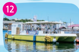
Jogashima "Sanshiro" Boat

This shrine is located on a hill, and, weather permitting, provides a view of Mt. Fuji. It enshrines a skipper as a god, so some people visit here to pray for a good catch.