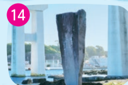
Monument of Kitahara Hakushu

Accommodates everyone, no matter what age and size, with handrails at different heights and several landings.