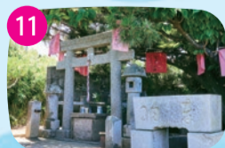
Kaji no Saburo-yama Shrine

The white tiles on the exterior make a refreshing contrast with the blue sky and give a modern impression. This is a symbol of the island, rebuilt after the Great Kanto Earthquake in 1923.