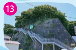
Tsunami Evacuation Stairs

This boat travels between Urari Marché Market in Misaki and Jogashima in 5 minutes. You can take your bike/rental bike aboard.