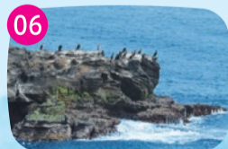
Habitat of Japanese cormorants

Strong sea breezes make these pine trees grow diagonally, creating comfortable shade and a perfect rest spot during a stroll.